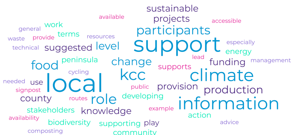
Key Actions from the Stakeholder Engagement

Engagement commenced with a workshop held in Dingle on June 1 st , 2023 to which key stakeholders in the DZ were invited. The workshop participants, from a range of backgrounds and groups (see appendix 1), were well informed and knowledgeable about the needs and challenges facing their own sectors. The participants saw a clear value in the designation of the Dingle Peninsula as a DZ. They welcomed the opportunity to bring coherence to the large number of ongoing activities in Dingle, under the umbrella of the DZ. Beyond their own sectoral activities, the participants identified several actions which KCC could take to further enable their efforts. The participants welcomed the opportunity to work collaboratively with KCC in the design, communication and implementation of the LACAP.