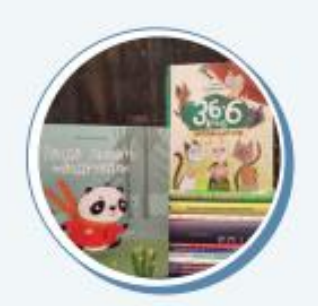
576,577 Items Borrowed