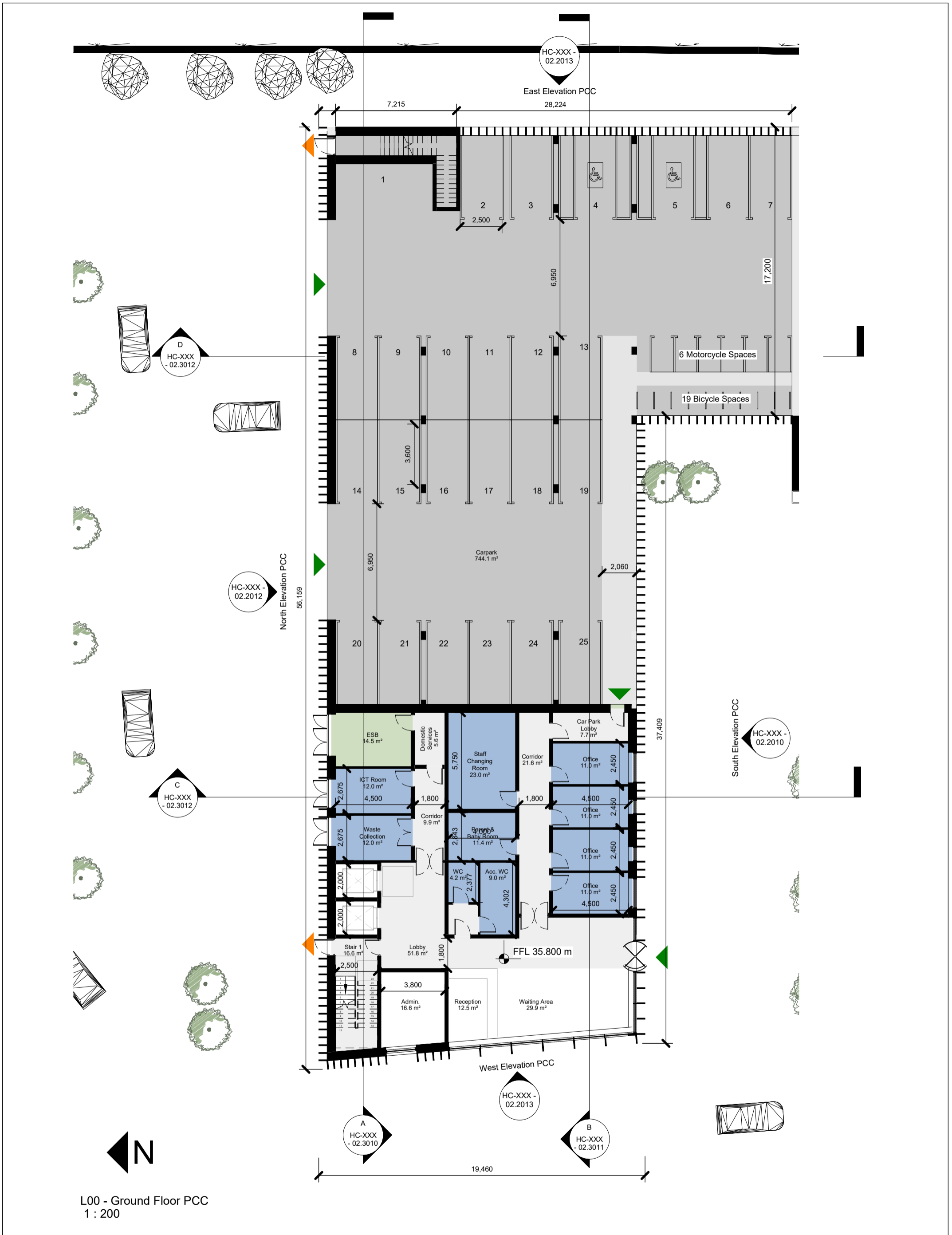
L00 - Ground Floor PCC 1 : 200