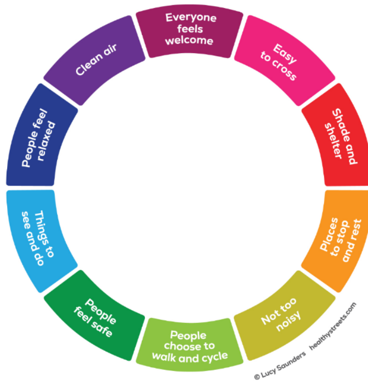
Figure 6.3: Ten indicators of a Healthy Street

The changing nature of society has resulted in greater car dependence and reduced levels of physical activity being undertaken by people over time. Physical design affects people’s behaviour at every scale - buildings, communities, villages, towns, and regions. The places in which we live, work, and play can affect both our physical and mental well-being.