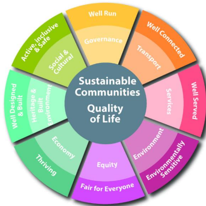
Figure 6.1: Elements of Sustainability and Quality of Life. Source: Adapted from Egan’s wheel on sustainability and quality of life (2004)

The Institute of Sustainable Communities defines a sustainable community as one “that is economically, environmentally, and socially healthy and resilient”. Common elements of a sustainable community include healthy and safe surroundings in which the needs of everyone are met, a strong economy with employment opportunities and an environment that is appreciated.