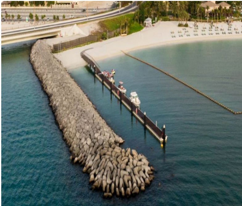
Breakwater with Floating pontoon (Dubai)