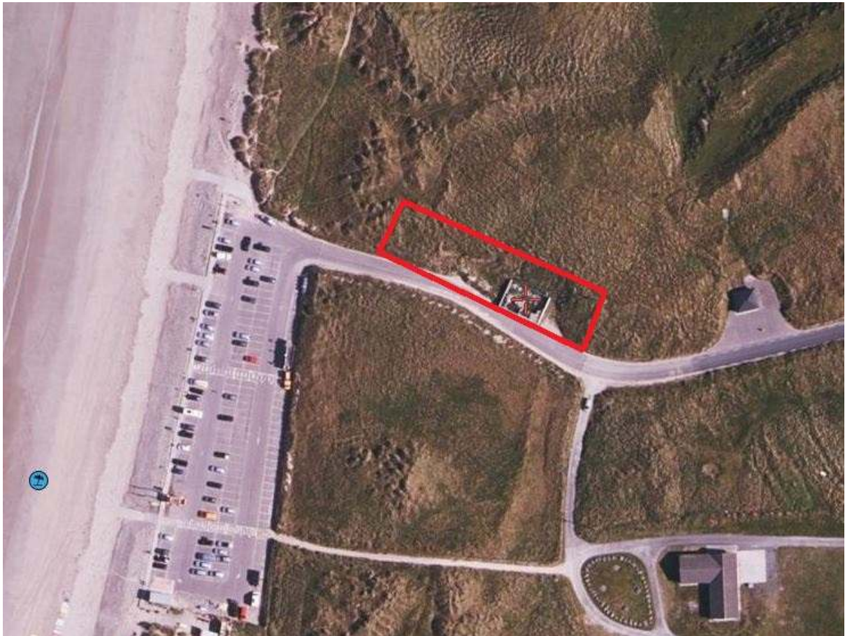
Figure 2. Ariel View of lands subject to the submission