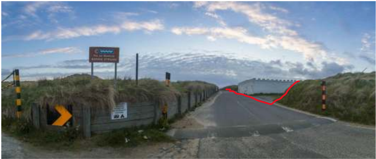
Figure 1 Approach Road and Entrance to Banna Beach Carpark 1 with 'The Shop' in the mid-ground.